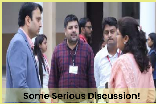
Some Serious Discussion!