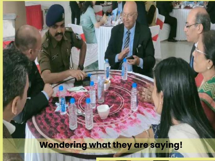
Wondering what they are saying!