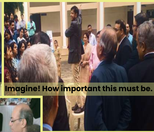
Imagine! How important this must be.