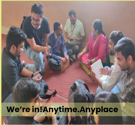
We're in! Anytime. Anyplace