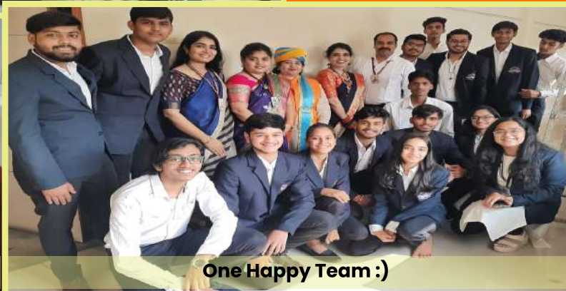
One Happy Team :)