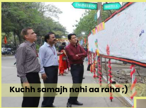
Kuchh samajh nahi aa raha ;)